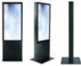
Totems TOT-XXA8-IR10 TOT-XXA8-CA10